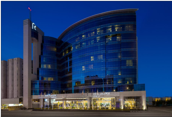
Rosh Rayhaan by Rotana, Riyadh

Rosh Rayhaan by Rotana, Riyadh is a five-star property with a fresh contemporary feel and an enviable location in the new heart of the Saudi capital within easy walking distance from vibrant Tahlia Street with its popular boutiques, cafés and restaurants. Accommodation is in 236 comfortable rooms and suites that are spread over eight floors and have been designed to meet the needs of the modern traveller. The generously sized entry-level Classic rooms (45sqm) are elegantly furnished and have a work desk, separate sitting area, and a marble bathroom with bathtub and walk-in shower. Premium rooms and suites are larger still. In room amenities include a 42" LED television,