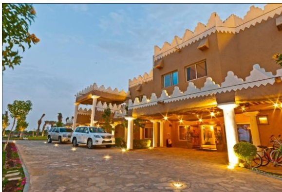
Malfa Resort, Unizah

Al Malfa Resort is a boutique property built in the local Qasimi architectural style that is set amongst the gardens and date palms of a working farm. Located a short distance outside Unizah, this charming hotel is accessed through two imposing fortress-like towers and along a palm-lined drive that leads up to the resort's main building. The exterior of this two story structure is surrounded by a wide portico that is lined with whitewashed columns and resembles a Saudi Arabian gingerbread house. Accommodation at Al Malfa Resort is divided between the main building and a second block built in the same style. The 39 ensuite guestrooms are warmly, but simply,