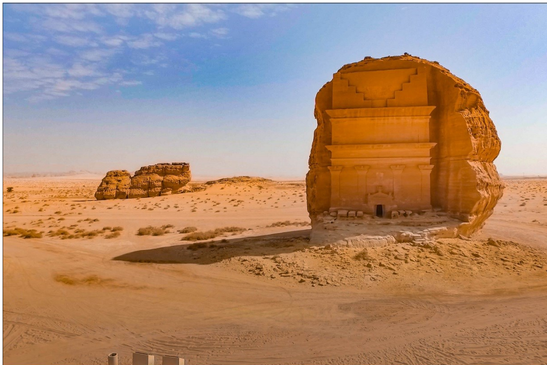
Qasr Al Farid, Hegra, Saudi Arabia

ITINERARY FOR: NORMAN & SUSAN DAILEY 5 OCTOBER TO 18 OCTOBER, 2021