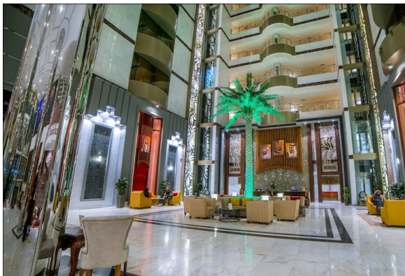
Holiday Villa, Ha'il

Holiday Villa, Hail is located just to the south of Hail's city centre, across the highway from the Prince Sultan Park, and is within a ten minute' drive from the historic A'arif fort and Qishlah barracks. This gleaming 4* glass-fronted international-style property has an impressive towering central atrium with an illuminated date palm at its centre. Accommodation is in a total of 228 air-conditioned ensuite rooms and suites – some of which have attractive city views. The guestrooms are decorated in a contemporary style and have a seating area, flat screen television, tea and coffee making facilities, Wi-Fi, and floor to ceiling windows. A choice of dining options is available at the Holiday Villa, Hail ranging from