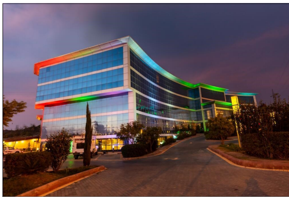
National Park Hotel, Baljurashi

National Park Hotel, Baljurashi is a cut above many regional hotels in Saudi Arabia and is well located for exploring scenic Al-Baha province. Set on a ridge with views looking over the Sarawat Mountains, this modern 4-star property has an attractive terrace and garden where guests can relax over a coffee or soft drink and enjoy the cool mountain air and views. The property's 62 spacious guestrooms are attractively decorated and face either the mountains or the carpark and Al Baha to Baljurashi road. Each ensuite room has a separate sitting area and is equipped with flat-screen television, writing desk, mini-fridge, kettle, and Wi-Fi. Service is willing but can be haphazard. Drinks and snacks are available on the